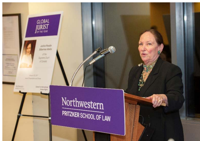
Justice Rosalie Silberman Abella of the Supreme Court of Canada speaks at the Global Jurist of the Year Dinner and Award Ceremony.