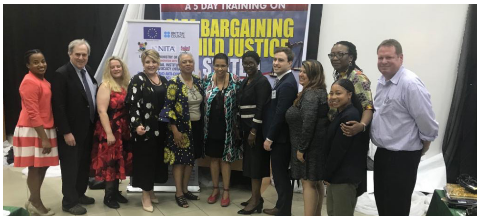
Joint Training of Lagos, Nigeria Public Defenders held by the National Institute for Trial Advocacy, Baker McKenzie, and the Bluhm Legal Clinic.

International Human Rights Law: Differing Perspectives, Europe, the Americas, the US