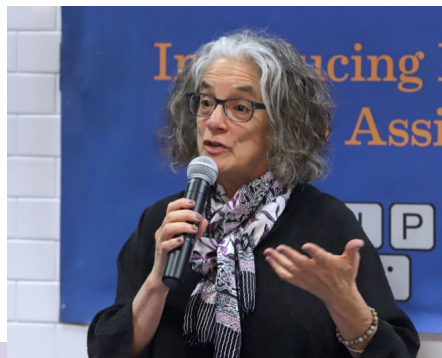
Lainey Feingold Author, Structured Negotiation