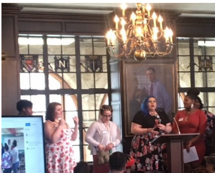
Students from Alliance High School Restorative Practices Class

The Center hosted a variety of events this year about restorative justice, negotiation, and dispute resolution in sports.